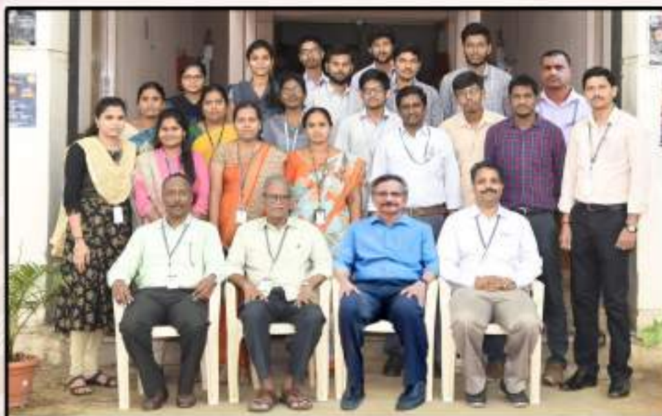
RACE Body Members